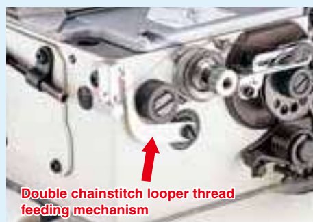
Double chainstitch looper thread feeding mechanism